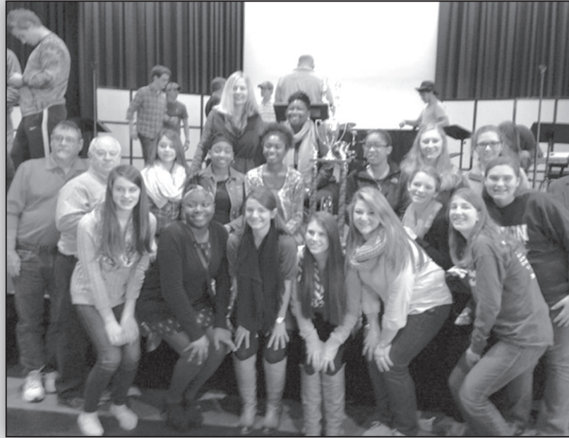
In addition to the junior boys, the Epworth Memorial Senior Girls team also brought home a trophy to campus. The girls received the tournament’s Milford Sportsmanship Award.