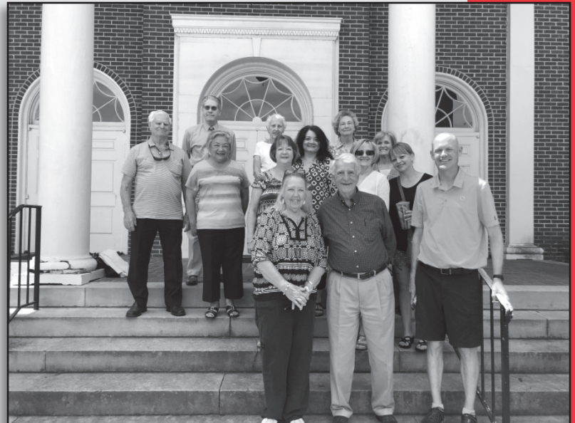
St. Andrews Parrish UMC